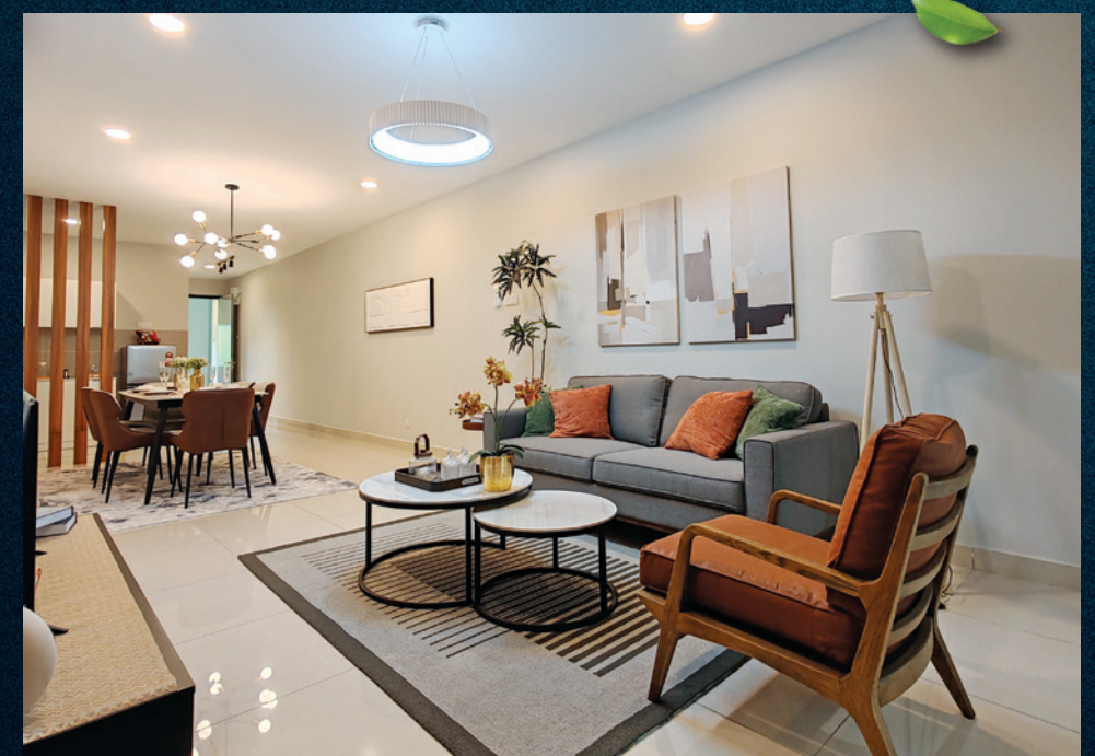
Actual show unit photo