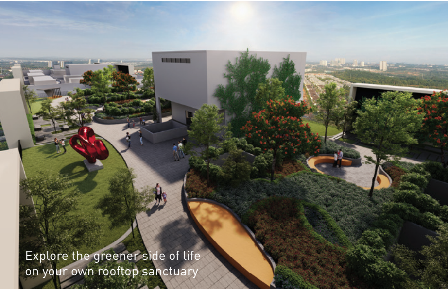
Explore the greener side of life on your own rooftop sanctuary