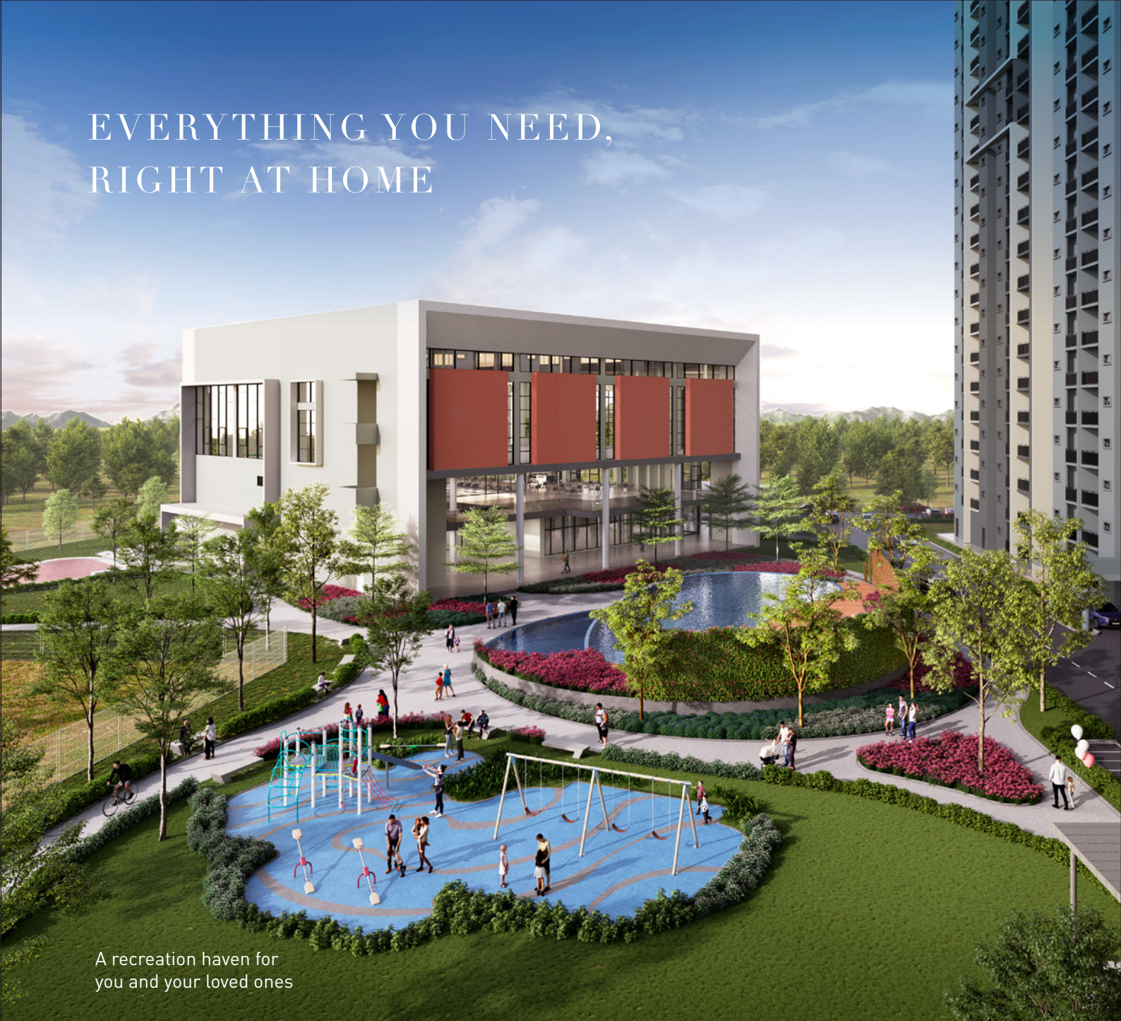
A recreation haven for you and your loved ones